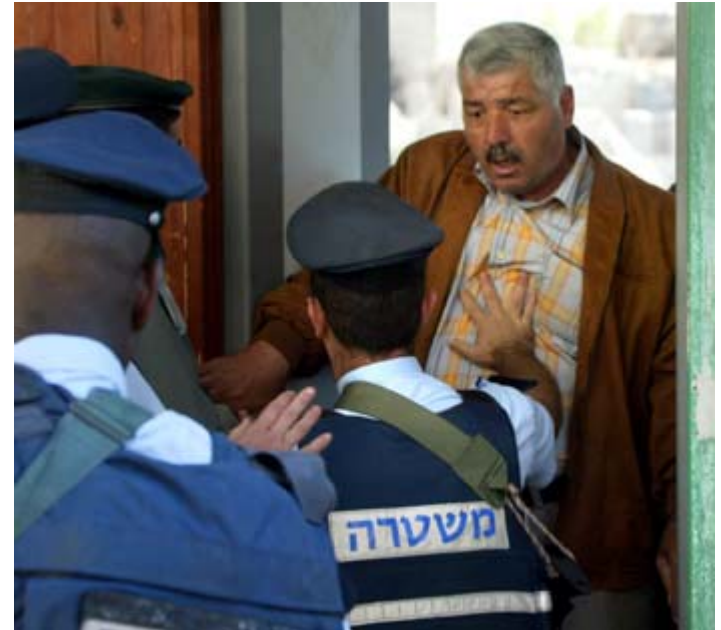
October 7, 2005- In the West Bank city of al-Khalil (Hebron), Israeli policemen prevent a Palestinian from entering the Ibrahime (Abraham) mosque on the first Friday of Ramadan.