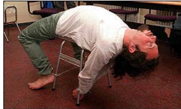
An actor demonstrates one of the torture positions used during interrogations of Palestinian detainees.