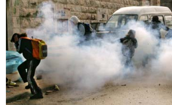
November 22, 2005: Palestinian school girls run away from an Israeli soldiers' tear gas thrown at them at a checkpoint in the Palestinian city of al-Khalil (Hebron)

“To the fullest extent of the means available to it, the Occupying Power has the duty of ensuring and maintaining, with the cooperation of national and local authorities, the medical and hospital establishments and services, public health and hygiene in the occupied territory, with particular reference to the adoption and application of the prophylactic and preventive measures necessary to combat the spread of contagious diseases and epidemics. Medical personnel of all categories shall be allowed to carry out their duties.”