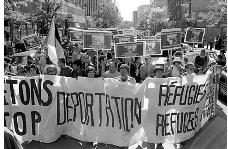
Canadians who oppose Israeli policies – especially Immigrants and refugees – have good reason to be wary of possible information-sharing between Canada and Israel under the Declaration signed in March, 2008