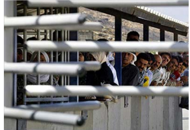
Palestinians queue up at a highly fortified checkpoint in the occupied Palestinian territories. Such checkpoints are a focal point for humiliating and abusive treatment by the Israeli Army and other Israeli security forces.