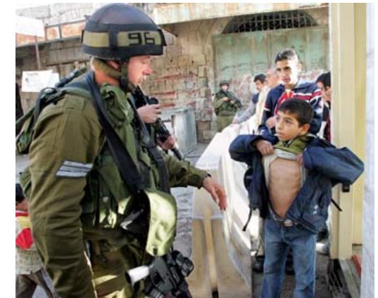
November 20, 2005- Israeli soldiers search a Palestinian boy on his way to school for explosives devices