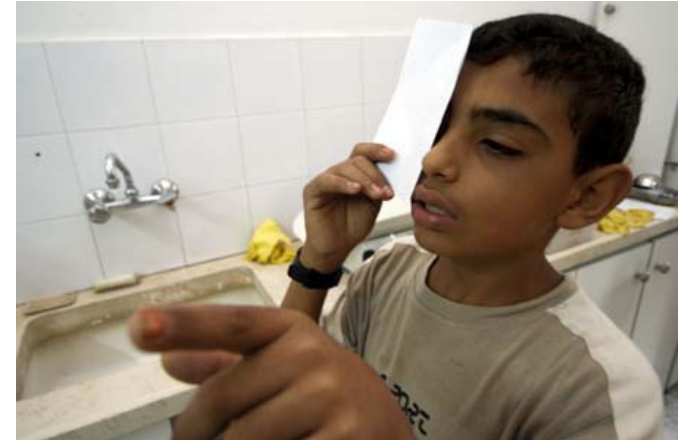
Ama'ri Refugee Camp in Ramallah: A young Palestinian gets his eyes tested in the local health center