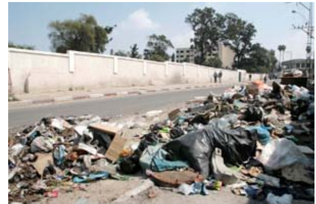
Trash piles up in Gaza because there is not enough fuel to provide garbage collection.

Collective Punishment: “The punishment of a group of people as a result of the behaviour of one or more other individuals or groups. The punished group may often have no direct association with the other individuals or groups, or no direct control over their actions”