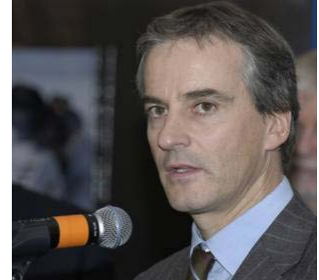
Norwegian Foreign Minister Jonas Store